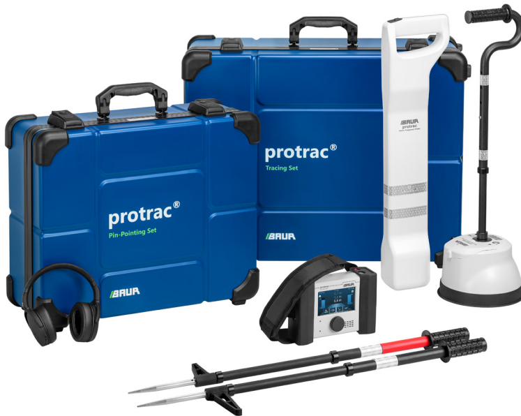
The figure is illustrative.