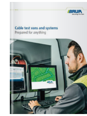
Cable test vans and systems