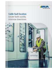
Cable fault location